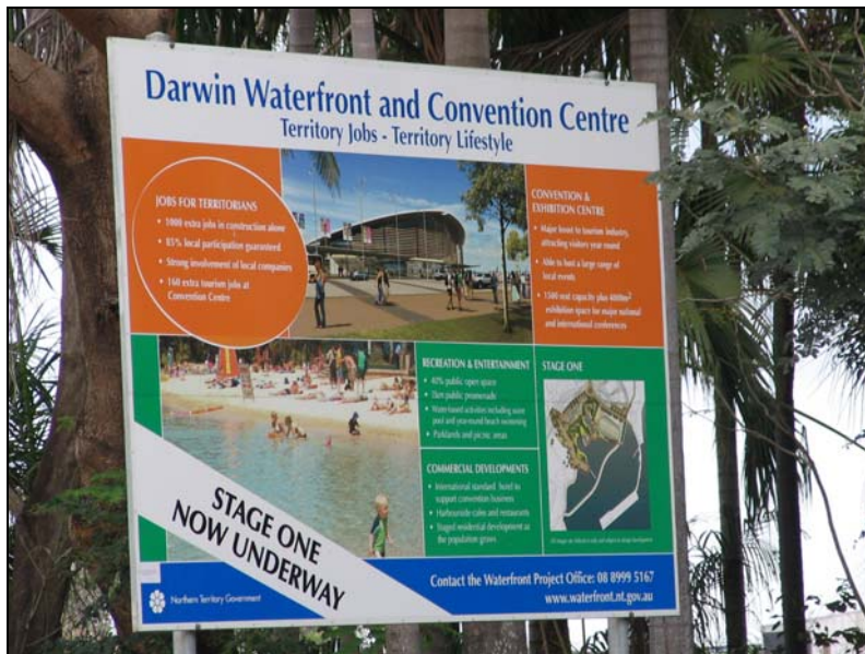
The Darwin Waterfront Project is now underway. The total project has an estimated value of $1billion. Construction of the various stages will span over 15 years.

The Board has had a physical presence in Darwin since March assisting in the development of the scheme's infrastructure, policy, operational processes and providing field support to the Board (NT Build). The scheme, which commenced on the 1 st July 2005, will benefit all construction workers transferring to or from the Territory. The scheme in this state will benefit from improved funding levels and potential alliances with NT Build.